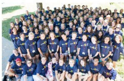
2022 Session 2 participants