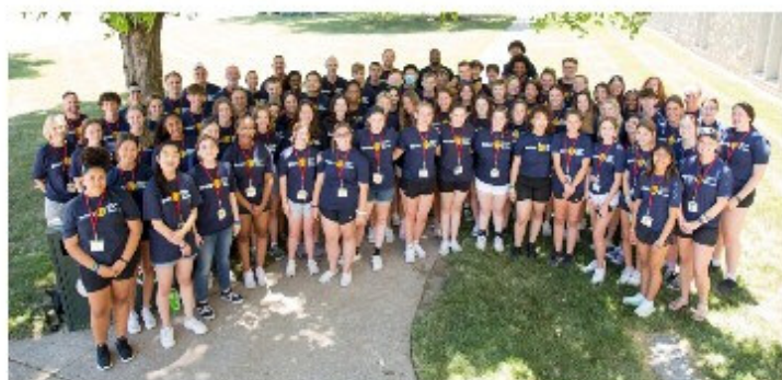
2022 Session 1 participants

The most common question from clubs is how do clubs find and select students to attend? Many clubs work with their local high school guidance counselors to find the right kind of students. What does that mean? We are looking for students who have a heart for service.