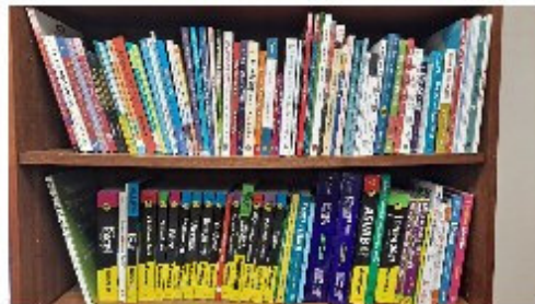
Branson-Hollister--The Taneyhills Library has made good use of the 2022 Flavor of the Ozarks grant money. The first shipment of books has arrived.