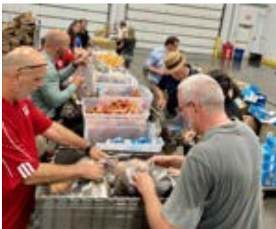
West Plains Sunshine and Noon Rotary Clubs teamed up with school district administration to pack over 1,200 backpacks with weekend food for kids in need.