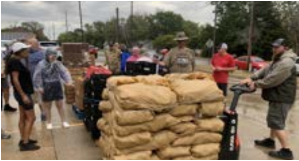
Warrensburg Rotary volunteered at the Harvest of Hope food distribution in Warrensburg.