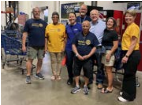
Springfield Rotary Club volunteered at the CrossLines Food Pantry.