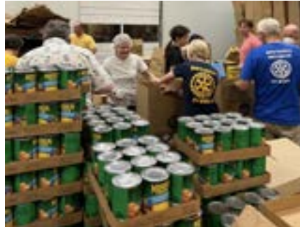
Columbia South Rotary members volunteered at The Food Bank for Central & Northeast Missouri.