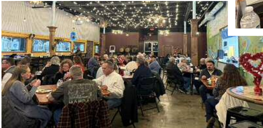
Springfield Southeast Rotary (right) enjoyed a fellowship event, Bingo at Metro.