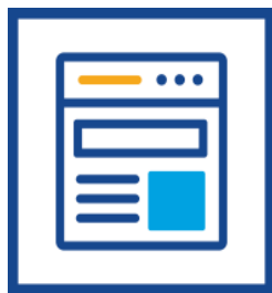
Brand Center resources

There are a number of Rotary resources available to support clubs in this vital role. Make use of these promotional tools to help build your club's public image and expand Rotary's reach. Click on each box to access the information: