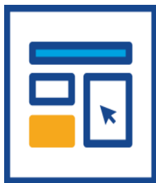
Learning Center resources