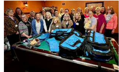
CASA advocates with duffel bags for foster children provided by Fulton Rotary.

With a $2,000 grant from Rotary District 6080 and $3,650 from its own charitable fund, Fulton Rotary is partnering with Heart of Missouri Court Appointed Special Advocates (HOM CASA) and Foster Love to provide 70 Sweet Case Duffel Bags to foster children in Callaway County.