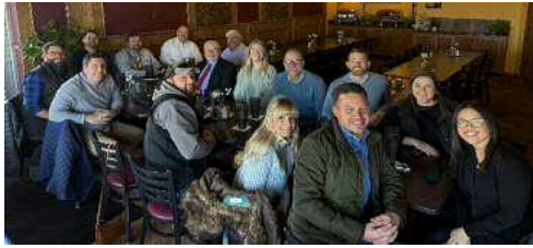
Springfield Sunrise Rotary (left) met at Bellacino's on South Glenstone for their monthly "Rotarians Favorite Lunch Spots" social.