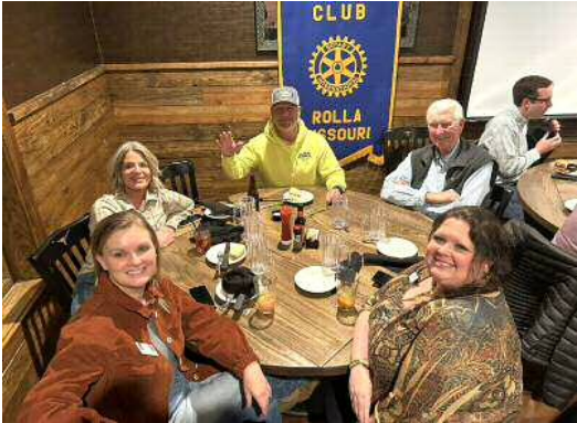
Rolla Lunch Rotary (left) celebrated its 90th anniversary.