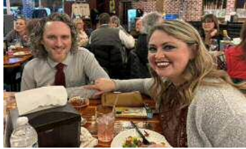
Lebanon Rotary (right) held a Valentines social and fundraiser at Boat Town.