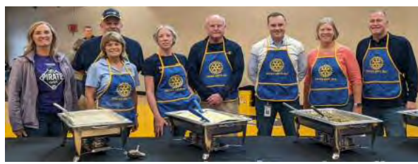
Belton-Raymore Rotary members volunteered to serve meals at Belton School District's annual Spring Senior Citizen luncheon.