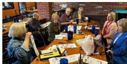
Rotarians and KCHS members meet to review their Peace Builder plans.

and to develop a traveling display for the historical society. The project, "Peace Builder: Getting to Know Your Neighbors in Callaway County," hopes to address misunderstandings about the role migrants play in economic and social changes in an area in hopes of building civility toward new people and better communication among diverse members in the community.