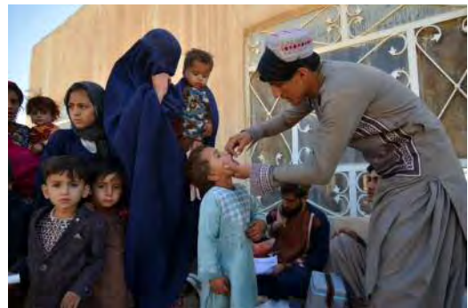
An Afghan health worker administers polio vaccine drops to a child during a polio vaccination campaign in Kandahar on December 23, 2024. The Taliban suspended door-to-door campaigns.

In August 2024, the Taliban announced a temporary suspension of door-to-door vaccination campaigns across the country . No official reason was provided; however, health workers familiar with the situation said that the ban was a result of suspicion of Western aid and the Taliban's restrictions placed on women workers, who aren't allowed to travel without a male legal guardian.