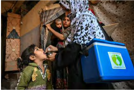
A health worker in Karachi administers polio drops — the oral vaccine — on February 3, the first day of a nationwide polio vaccination campaign. The country, one of only two where wild polio circulates, has seen a rise in cases due to issues with vaccination campaigns.

APRIL 16, 2025 7:14 AM ET By Betsy Joles , Ruchi Kumar