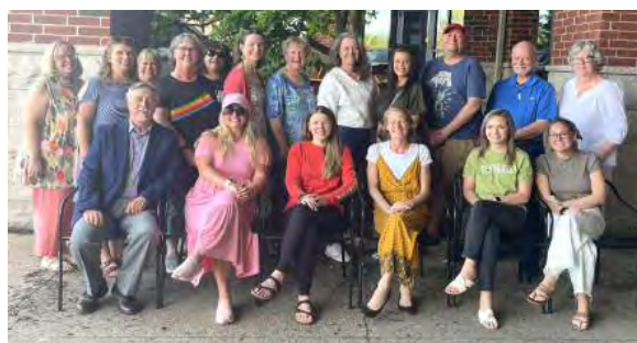
Columbia Metro Rotary is proud to have served as a Partner in Education with these amazing preschool teachers (left) for over 22 years.