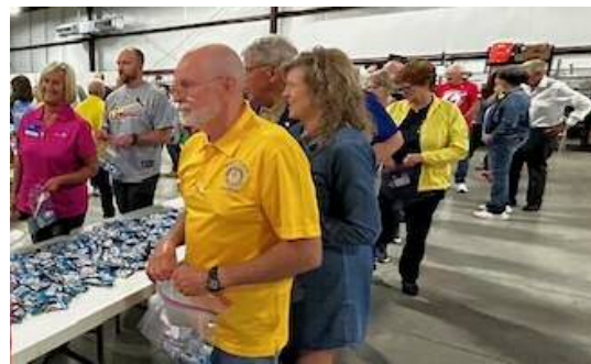
Filling snack packs for Care to Learn to give to children