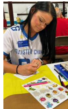
Creating Love Notes for Ozarks Food Harvest to place in children's weekend food backbacks