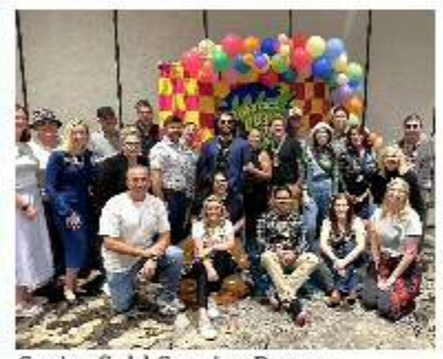
Springfield Sunrise Rotary