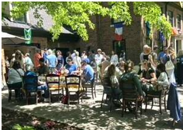
People enjoy the Crêpe Fundraiser.