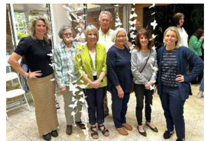
A few of the Fulton Rotarians in attendance

Some of the peace artwork created by Fulton public school students