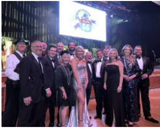
Springfield Sunrise Rotarians (left) attended the Route 66 Telegraph Ball.