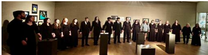
Fulton High School Chamber Singers

Fulton Rotary, William Woods University Rotaract and Fulton High School Interact collaborated to create a peace exhibit in the WWU art gallery during Rotary Youth Service Month. All the artwork was done by Fulton public school students. The FHS Chamber Singers provided the entertainment.