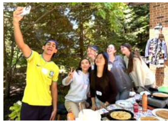
Exchange students take a selfie while volunteering.