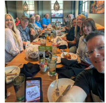
Belton-Raymore Rotarians (right) held a 5th Wednesday celebration on April 29 at Belton's new Olive Garden.