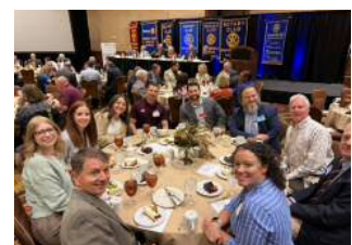
Springfield Sunrise Rotary enjoyed Wine and Whiskey Wednesday on May 20.